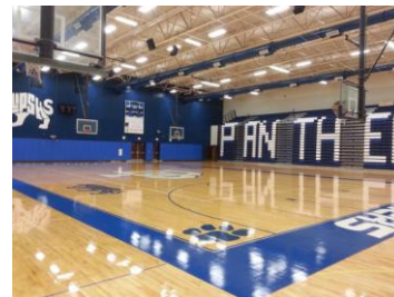
Dr. Phillips High School 6500 Turkey Lake Rd. Orlando, FL 32819

GRADE DIVISIONS: 3 rd grade – 11 th grade Boys